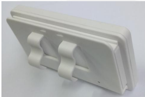
1. Hook fixed