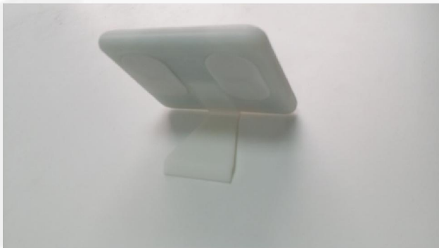
3. Stent fixed